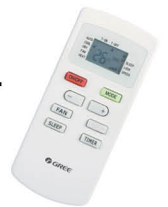
Optional Remote ETAC-REMOTE-KIT-A